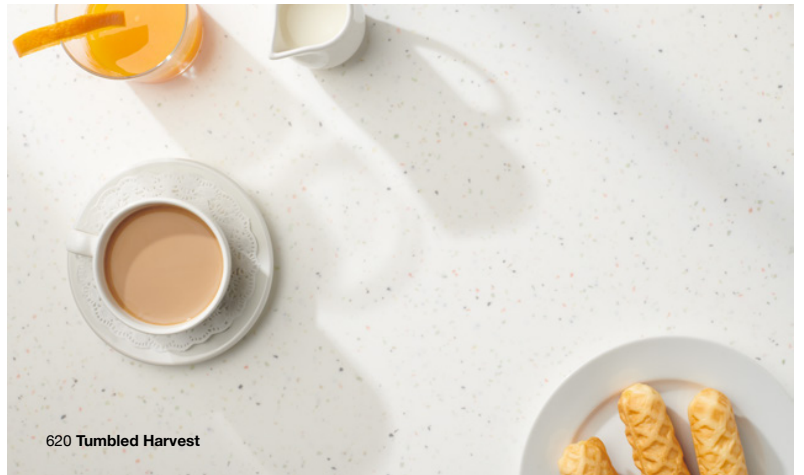
620 Tumbled Harvest

COLOR # _____ COLOR NAME _____ SIZE _____ THICKNESS _____