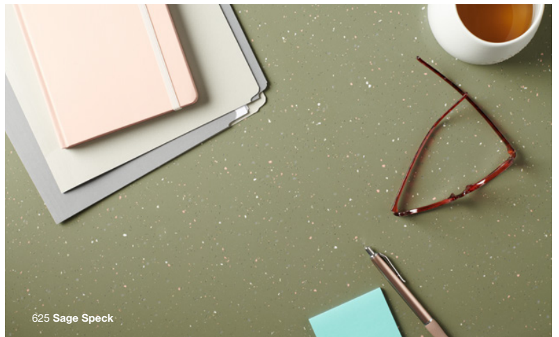
625 Sage Speck